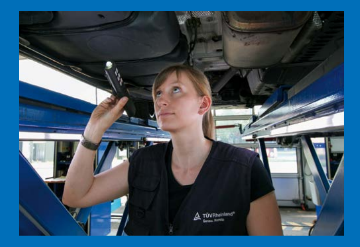
general vehicle inspections, for instance there are covert tests with prepared vehicles and unannounced follow-up controls. "When differences in results emerge, such as when an expert overlooks a defect, these are immediately counteracted to improve the quality of the testing." If your assessments are wrong too often, you can lose your license to test.

For added security, internal and external quality controls are applied. Reports are checked by random sampling; for the