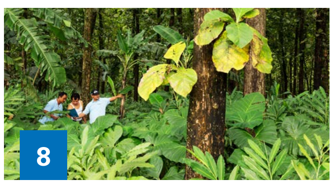
Activities and Inspections THE LICENSE TO TEST