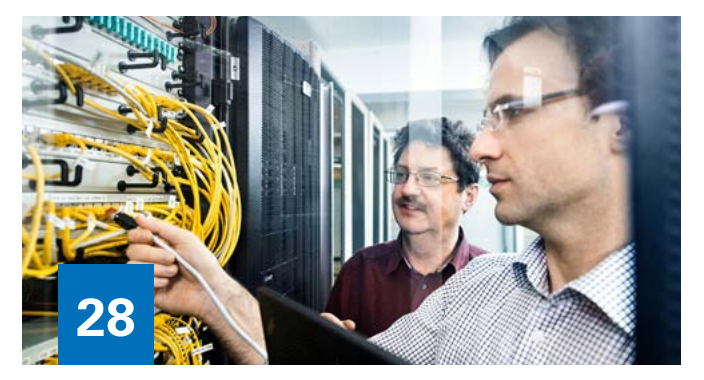
Testing IT Systems and Telecommunications Networks WORKING FOR A SECURE DIGITAL WORLD

Ensuring quality and safety in the interaction between man, technology, and the environment: This has been TÜV Rheinland's mission for over 145 years. As a global testing service provider, we face a range of challenges to pursue this every day. Our experts test cars, technical installations, and entire power stations as well as process workflows and management systems. They are committed to lifelong learning and are dedicated to upholding holistic health management within companies. Issues such as Industry 4.0, digitization, and networking systems are becoming increasingly important. And when it comes to these issues, quality, reliability, safety, and functionality are also particularly critical factors. How can all these factors be addressed? How does TÜV Rheinland ensure that this occurs? In other words: How do independent testers work today? Read on to learn all about the testers.